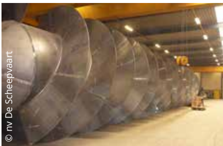
An Archimedes screw in production.

The cost of installing the screws is about EUR 7 million for each lock system. The benefits include ensuring navigability of the canal under changing climatic conditions, reliability of the canal for shipping and electricity generation. A hydrological and economic analysis, including climate change, concluded that on an annual basis more energy will be generated than used. The exact annual amount of power generated will depend on the amount and distribution of rainfall over the year, the future shipping intensity and the amount of withdrawal by other water users. The net effect on greenhouse gas emissions over time will depend on these same elements, but is generally favourable.