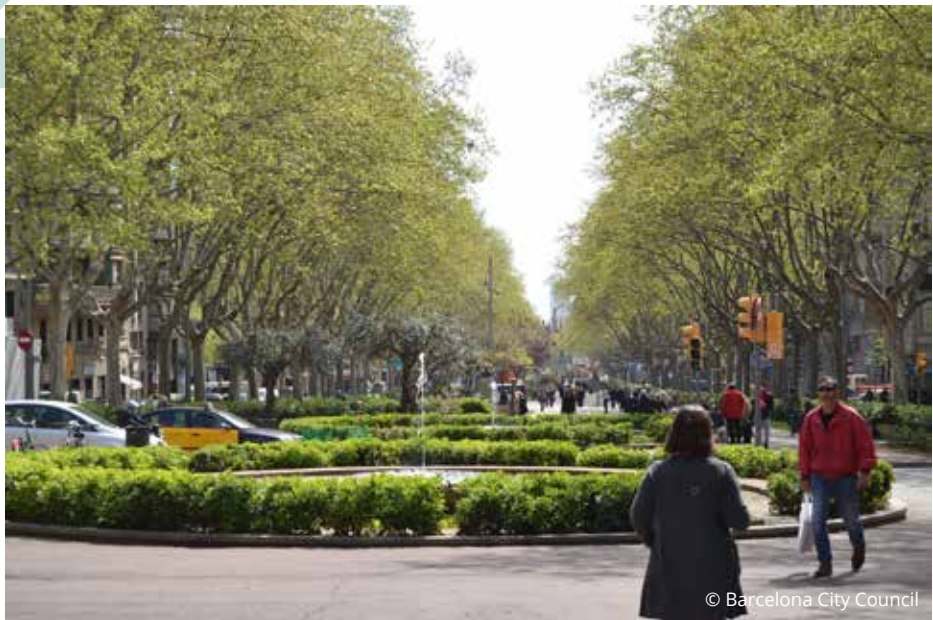
Green corridor at Passeig de Sant Joan, Barcelona.

Besides climate-related benefits, city trees can also provide co-benefits: removing air pollutants, storing carbon, reducing noise pollution, regulating humidity and balancing the water cycle, creating ecological connectivity, providing habitat for urban biodiversity and creating a pleasant urban landscape.