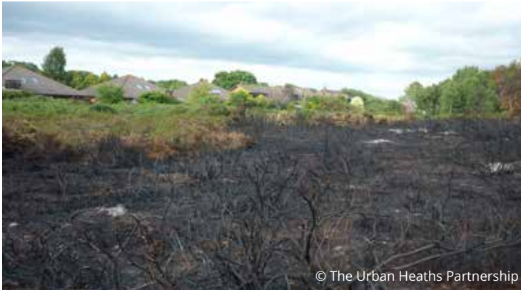
A large fire on 9 June 2011 destroyed 56 hectares of Dorset heathland.

The fees fund a number of measures to reduce the impact of development on the Dorset heathlands. Such measures include improvement or development of recreational sites to divert the recreational pressure from the most sensitive heathlands; land purchased as alternative open space; provision of more rangers and wardens; purchasing monitoring equipment; land management to reduce fire load and risk of fires; and purchasing firefighting equipment.