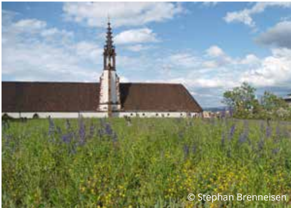
Green roof at University Hospital, Basel.

Green roofs tend to be 10-14 % more expensive than traditional roofs over their lifespan because of their initial costs (the cost of maintaining a green roof is similar to that for a traditional roof). Thus, a 20 % reduction in green-roof construction cost (such as that achieved through the subsidy scheme) is considered sufficient to equalise the costs of green and traditional roofs for investors. This means that green roofs are not only a sustainable solution but also a financially feasible option. Green roofs have multiple direct benefits and co-benefits, including lowering indoor temperatures (by as much as 5 °C) resulting in energy savings; absorbing rainwater and delaying runoff, thus reducing flood risk due to intense rain events; reducing the temperature in densely built-up areas, providing habitat for urban wildlife and 'stepping stones' for migratory species; and providing a more aesthetically pleasing urban landscape.