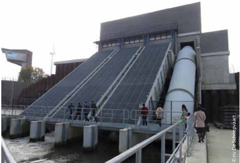
Overview of the four Archimedes screws installed in one of the six lock systems. The last screw on the right is equipped with a casing to avoid harming fish.

The Albert canal connects the industrial zones around Liège with the harbour of Antwerp. Ships can access both ends of the canal: via the River Scheldt to the Netherlands and via the River Meuse to France. It is an economically important waterway for Belgium, with a total traffic of 40 million tonnes/year. It also helps reduce the number of trucks on the highways by some 6 000 trucks/day, and results in less air pollution and congestion. In some, currently rare, cases, the discharge of the River Meuse is not enough to feed all the canals in Flanders and the Netherlands. During these periods, the low water level of the Albert canal means that the draft allowed for ships has to be reduced, making inland navigation less attractive as a mode of transport.