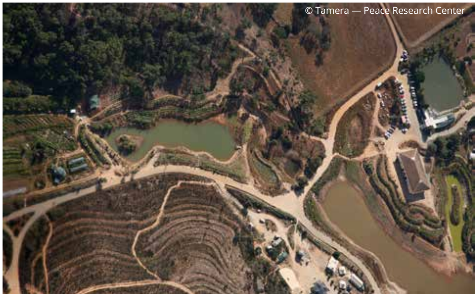
© Tamera — Peace Research Center

A WRL is a system for the restoration of the full water cycle: the rain which falls in the WRL area is retained by vegetation or in water bodies and recharges the groundwater; thus, there is no rainwater runoff. In addition, the retention area acts in place of the fragile humus layer and, through its high water-absorbing capacity, helps to prevent landslides and floods. In Tamera, 29 lakes and retention spaces were created and the area of water bodies was increased from 0.62 ha to about 8.32 ha between 2006 and 2015. These interventions have been integrated with other measures such as the construction of terraces, channels and rotational grazing land. Tamera is now prepared to fully absorb even heavy, continuous rainfall. This large retention area is located at the highest point of the valley. The gravity is therefore enough to enable irrigation of the land within the catchment, without the need for additional energy for pumping.