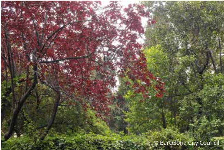
Plant stratification in the Parc del Laberint d'Horta, Barcelona.

Barcelona's Green Infrastructure and Biodiversity Plan 2020 (BGIBP) seeks to connect various areas of the city with green infrastructure. In line with the BGIBP goals, Barcelona's Tree Master Plan for 2017-37 identifies a number of actions to expand tree coverage and improve the climate resilience of the urban trees. These actions include the selection of tree species that are more resilient to water and heat stresses, diversification of tree species, increased use of runoff water for watering trees, automatic irrigation and control of water leaks. While Barcelona has a relatively small amount of green space per inhabitant, it has more street trees than most European cities.