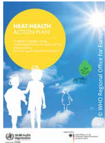
Front page of the Heat-Health Action Plan of the former Yugoslav Republic of Macedonia