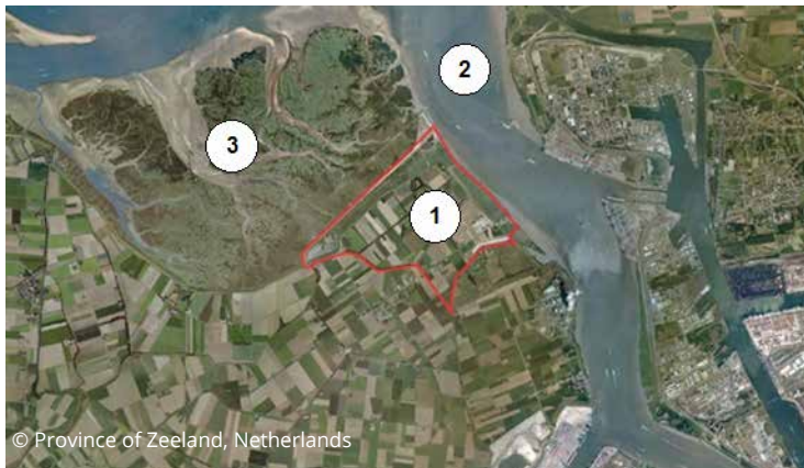
Aerial view of the project area: (1) Hedwige and Prosper Polders prior to depoldering; (2) the Scheldt river; and (3) the existing Saeftinghe tidal wetlands, next to the project area.

A cost-benefit analysis of alternatives indicated that the project would cost between EUR 66 million and EUR 75 million. As well as flood protection, other potential benefits from the project include improved water quality (the marshlands will contribute to the self-cleaning capacity of the estuary), an increase in natural wetland area and more recreational opportunities. Potential losses include the reduction of part of the cultural (farming) landscape and removal of current recreational opportunities, living space and agricultural land. The project costs for both the Polders will be covered mainly by the Belgian Sigma Plan, given the importance of the project for Belgian integrated water management objectives (shipping accessibility and flood protection).