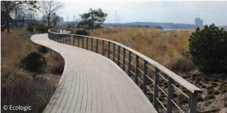
Landscaping measures in place.

Costs and benefits were quantified for two scenarios: a sea level rise of 0.30 m and one of 0.50 m. The estimated benefits are between four and eight times higher than the estimated costs of the measures. The upfront investment of EUR 30 million is the major cost (the same cost for each scenario). The main benefit is avoided damage from storm surges (EUR 71.5 million to EUR 170 million between 2011 and 2100), and the additional tourism shows substantial benefits (EUR 45 million to EUR 72 million from 2011 to 2100). The majority of investment costs (69 %) were covered by the regional government and EU funding through the Cohesion Policy, and the community covered about 31 % of the costs.