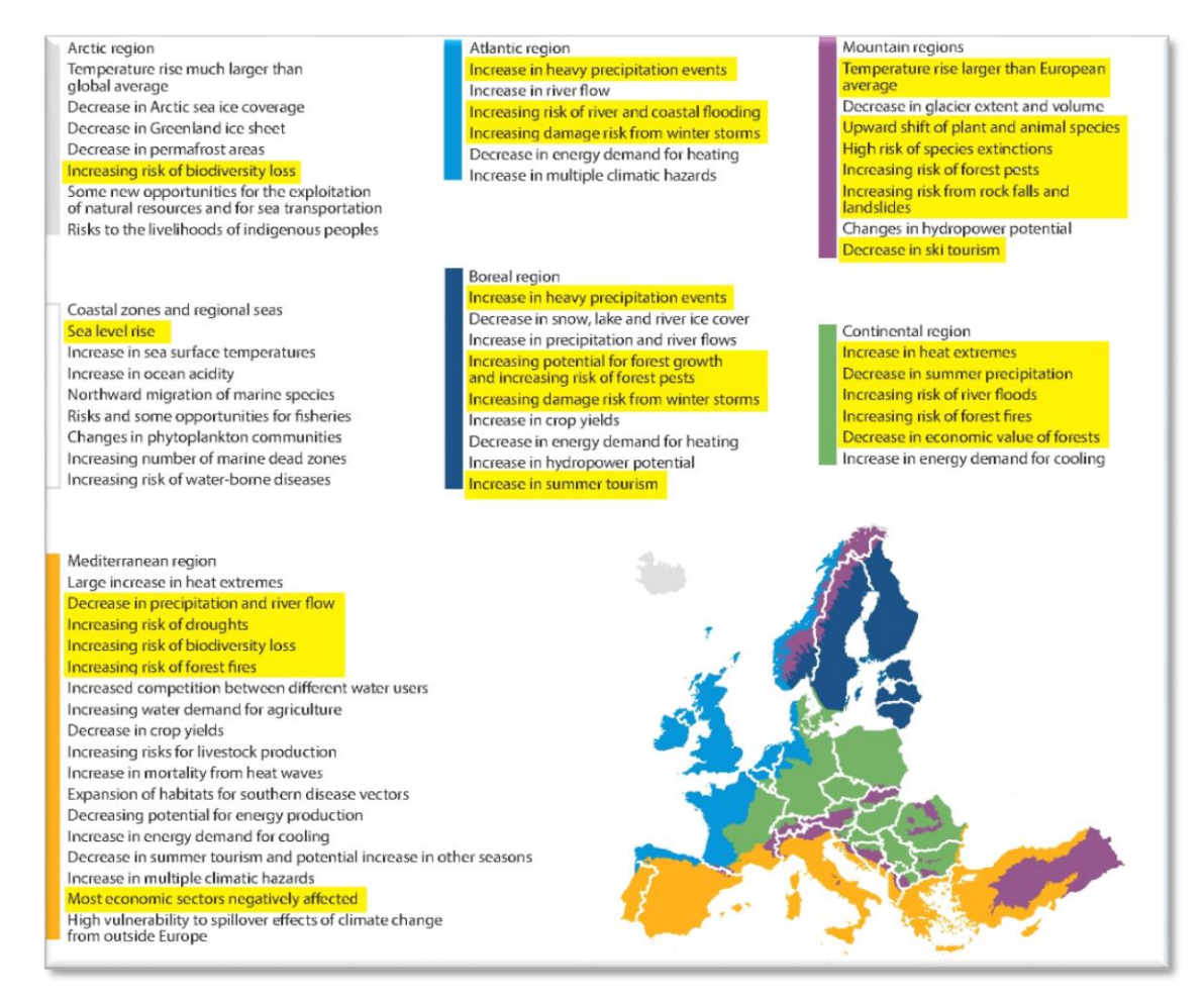
Figure 1: Observed and projected climate change impacts in the forestry sector in the different regions of Europe

Figure 1 highlights observed and projected climate change impacts on forestry in Europe by biogeographical region.