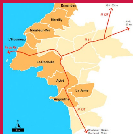
Perimeter of the PAPI.