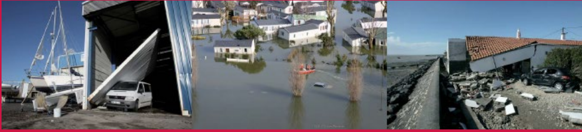
Perimeter of the PAPI.

The PAPI is expected to last for the next 5 years ( 2013-2017 ) and takes as a starting assumption a sea level 20 cm higher than the one observed during Xynthia flooding, taking into account the sea level rise due to climate change. This 20 cm higher level would triple the surface of the flooded area and would increase dramatically the people and goods impacted. The new strategy is developed on two main axes. The first one is the risk culture and its integration into the planning and development of backup plans based on early warning systems. The second one is the protection of human, economic and urban-related issues; with a particular focus on touristic ones (the region is highly touristic