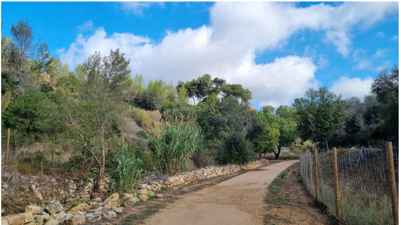
Figure 1: Permeable pathway and vegetation created for the river valley

As the Municipality of Cascais faces more frequent extreme weather events, it is considering new techniques for climate adaptation, including the renaturalisation of the Vinhas Greenway initiative. The city is interested in using urban rewilding methods that work harmoniously with the local geography and topography and require minimal long-term maintenance.