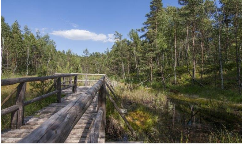
Figure 1: Peatland in Hochmoor Schrems.