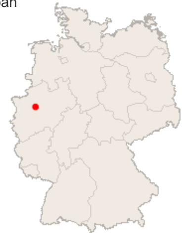
Figure 1: City of Herne's location.

Water Management, Ecosystem and Nature Based Solutions