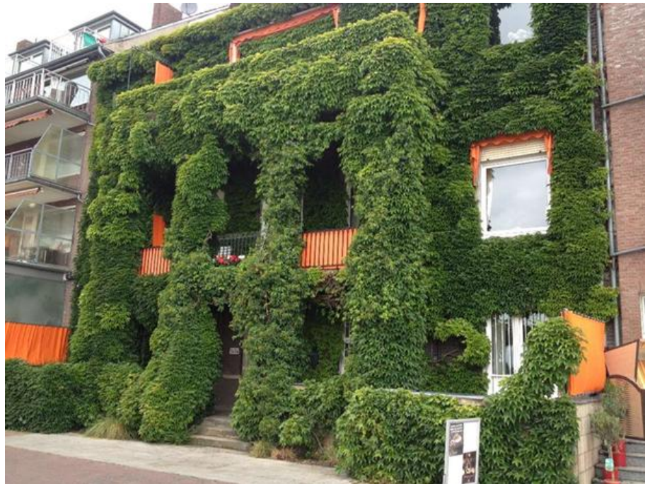
Figure 3: Intensive façade greening with wild vine.

Adaptation measures should accompany any building activity that increases surface sealing – for example, the creation or enlargement of parking spaces, houses, or garages. Sealed